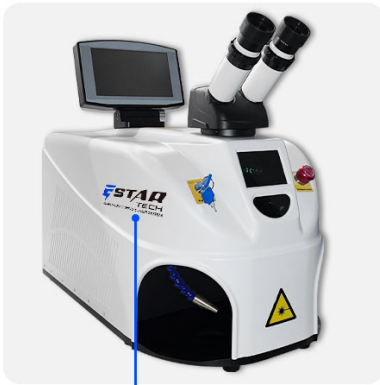
Customize your own logo

Tailor Your Machine's Appearance To Your Style