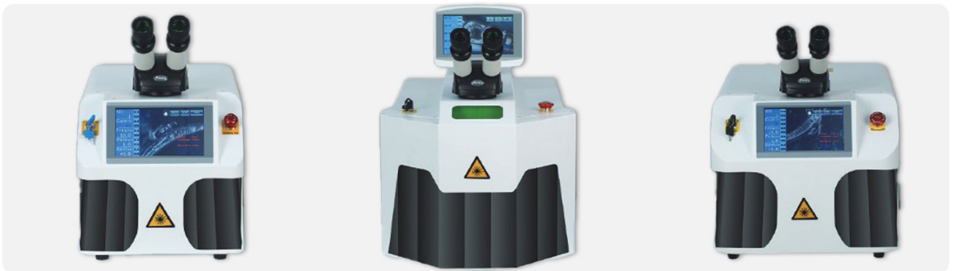
Install protective leather curtains — Safety meets sophistication