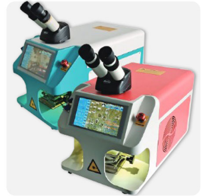
Mix & match colors