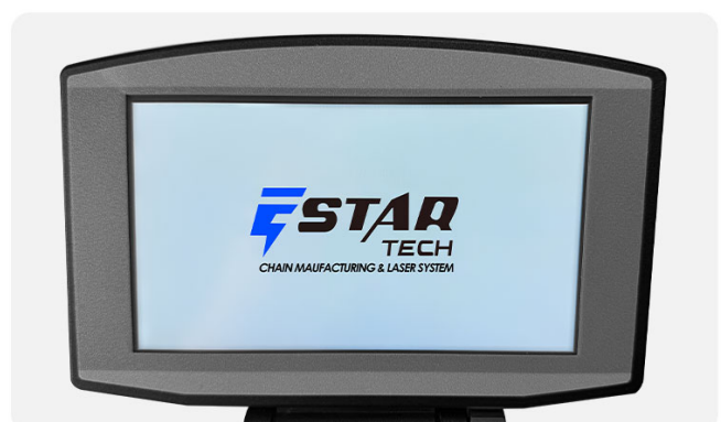
Customize your unique Logo startup screen