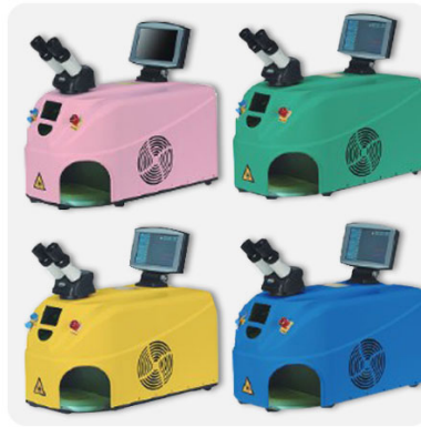
Personalize with solid colors